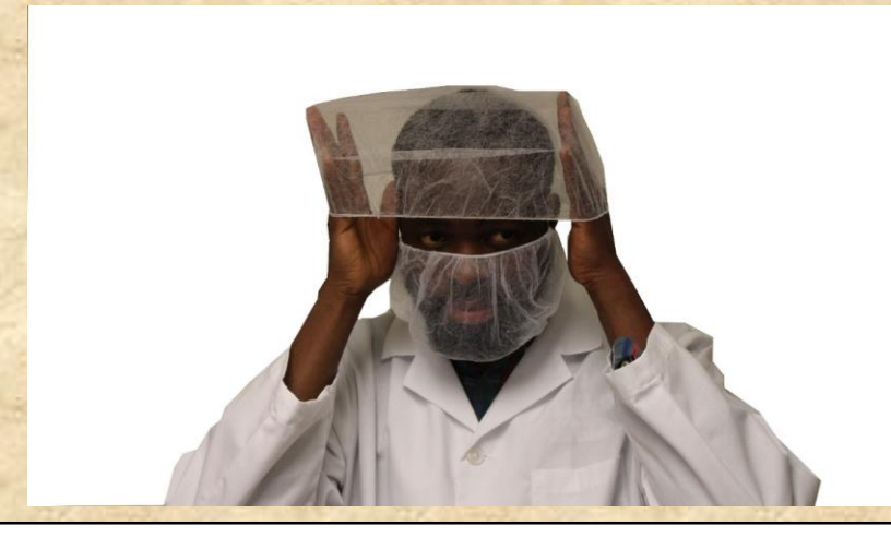
3. Put the hair net across your forehead and pull over the top of the head.