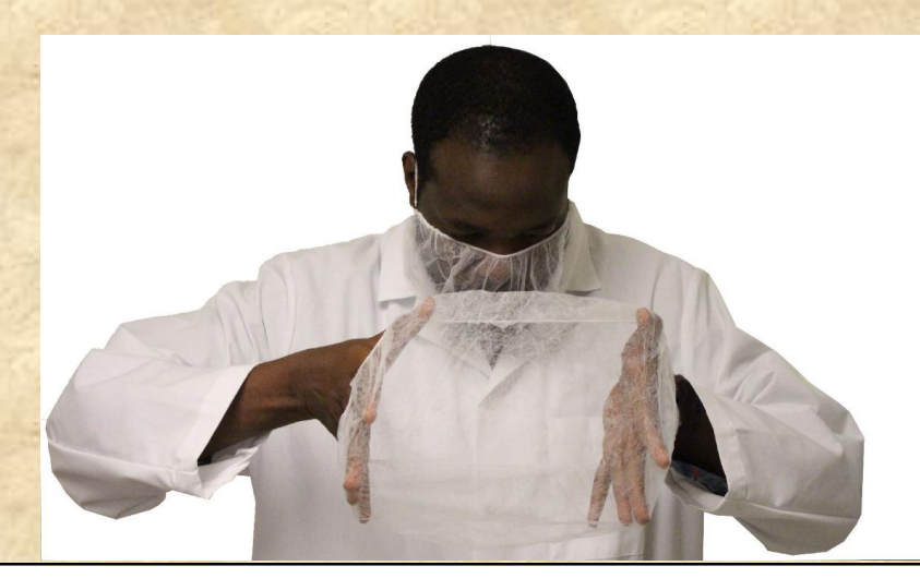
2. Hold the hair net open with the seams to the front and back of the head.