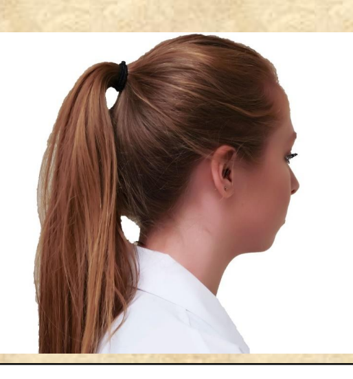
1. Brush and tie the hair back. The hairnet elastic needs to lay flat against the neckline.