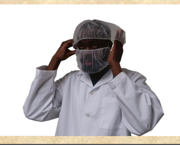
4. Completely cover ears with the hair net. This ensures that the hairnet is securely in place.