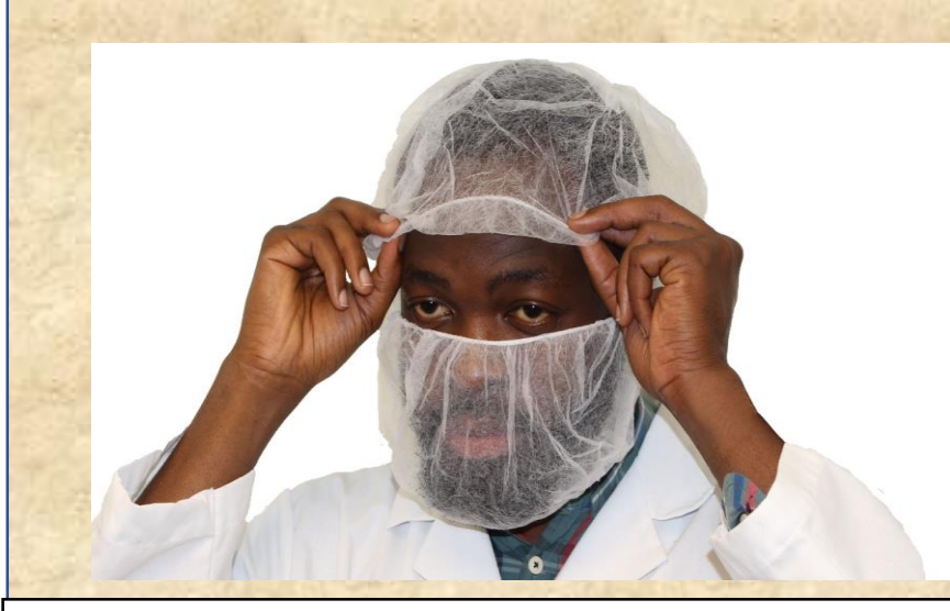
5. All hair must be inside the hair net. The elastic headband should lay flat under the ears.