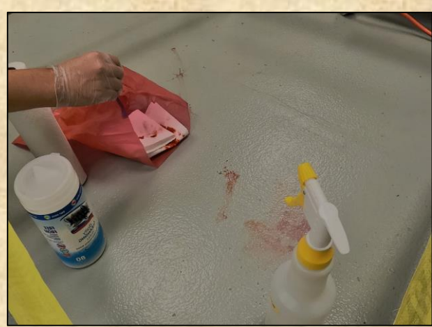
4. Wipe up blood with paper towels and throw the dirty paper towels in a biohazard bag.